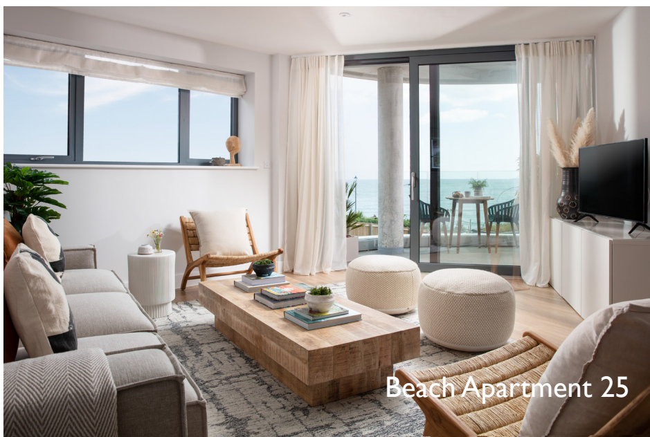
Beach Apartment 25