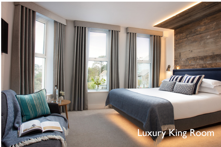
Luxury King Room