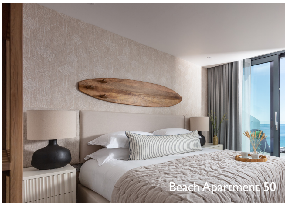
Beach Apartment 50